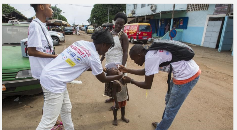
Immunization efforts continue in Africa, where recent setbacks underscore the need for vigilance everywhere until polio is eradicated worldwide.