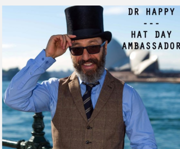
DR HAPPY --- HAT DAY AMBASSADOR

'HELP HATS HELP HEADS' Friday October 9 Recycle at www.hatday.com.au