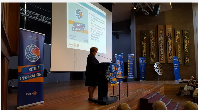
District Assembly photos.