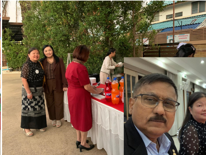
Dinner and belated Christmas/New Year Party with Kris Kringle