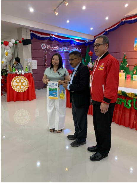
Exchanging Club banners with the Rotary Club of Nakhon Hariphunchai